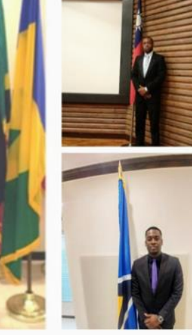
ARU Advanced Secondment Programme